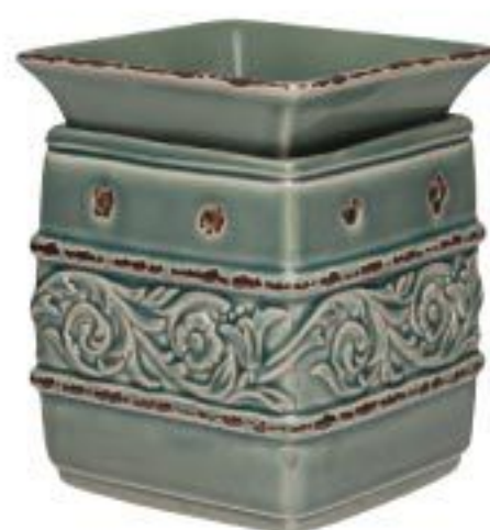
NEW Amerina C £30