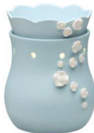
Baby's Breath £30