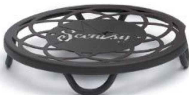
Round Warmer Stand STAND-ROUND-201 £10 13 cm x 2 cm