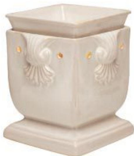
NEW Windsor R £30