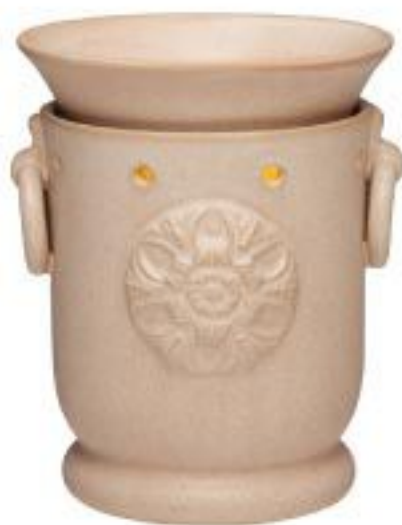
NEW Claremont R £30