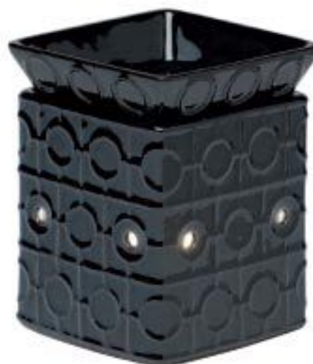
Onyx R £30