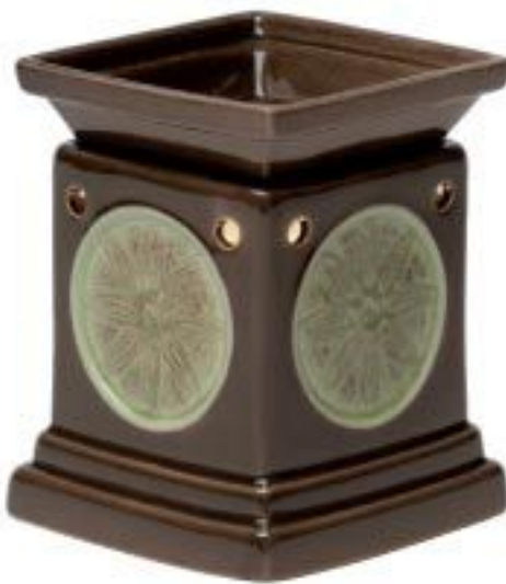
Lotus R £30