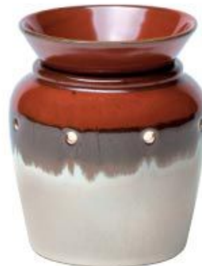
Delta R £30