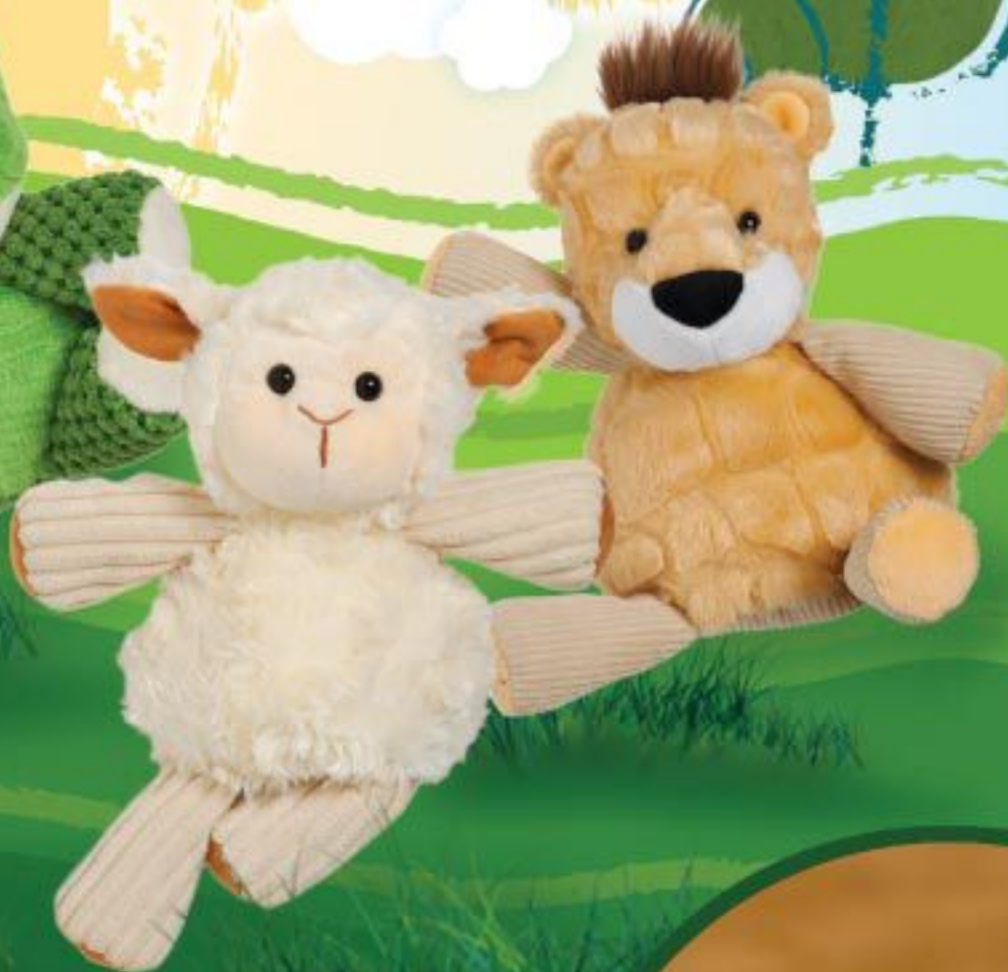
Baby Lenny the Lamb