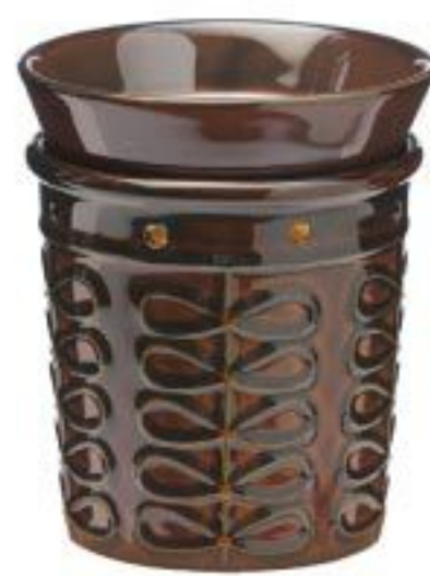
Farfalle R £30