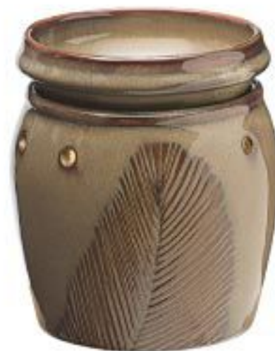
Quill R £25