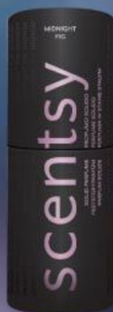
Midnight Fig £18