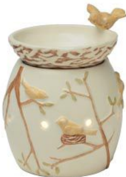
Nature's Haven £30