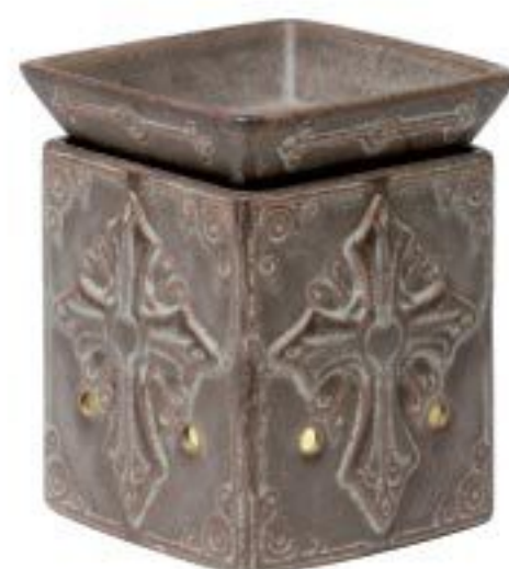
Hope R £30