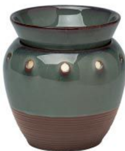
Jadestone R £25