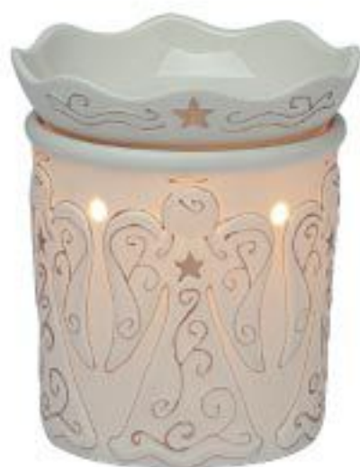
Heavenly [G] £30