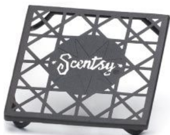
Square Warmer Stand STAND-SQUARE-201 £10 13 cm x 13 cm x 2 cm