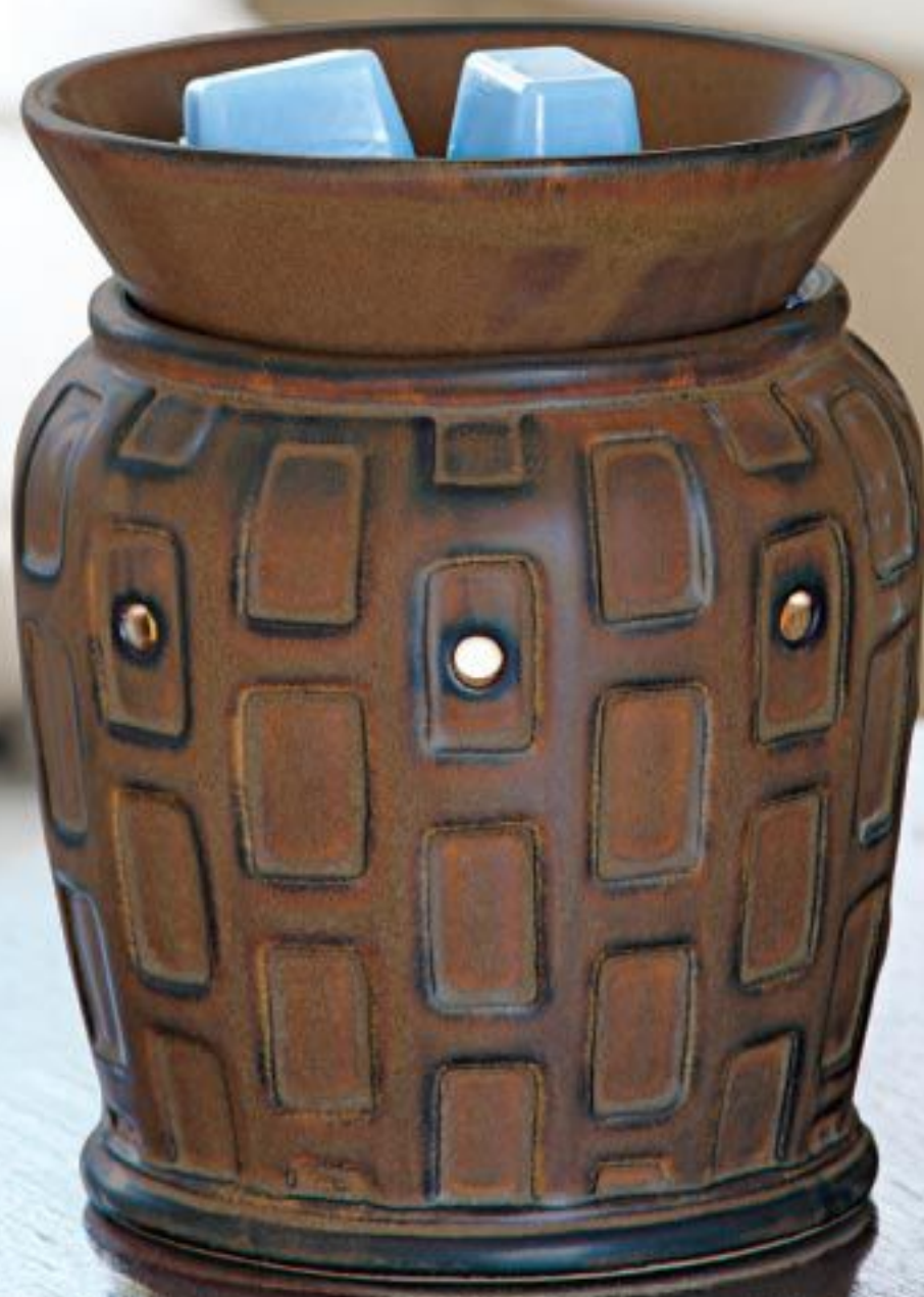
Strata Inlaid with bricks of burnt umber, Strata 's mesmerising organic pattern resonates in shades of rust, gold, and brown.