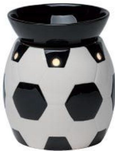
World Cup £30