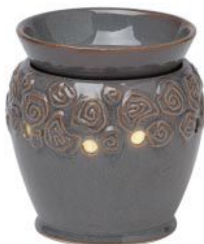
Enchanted R £25