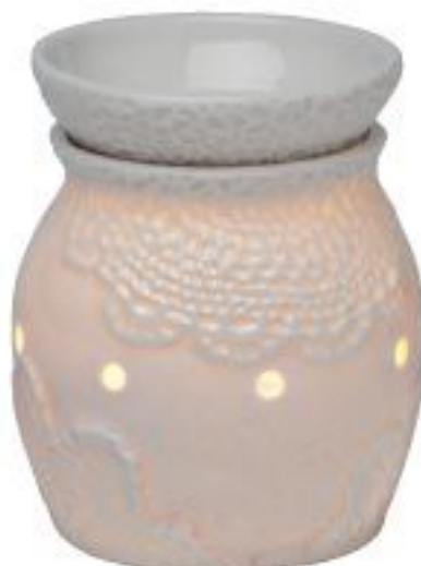
Heirloom [G] G £30