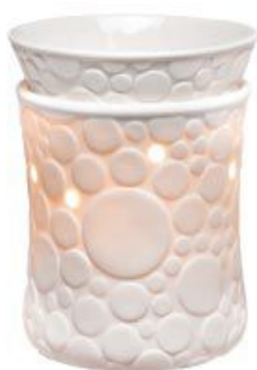
Fizz [G] £30