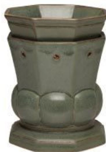
NEW Verdigris R £30