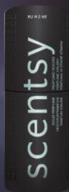
RU N2 ME £18