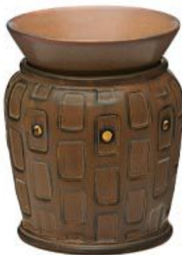
Strata R £30