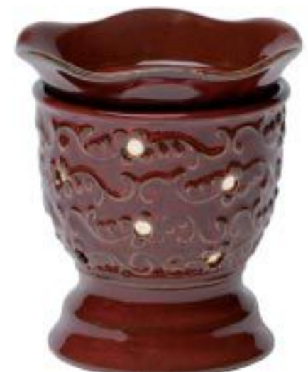
Roma R £30