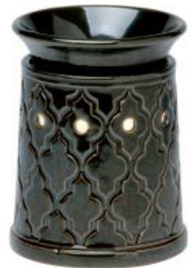
Morocco R £30