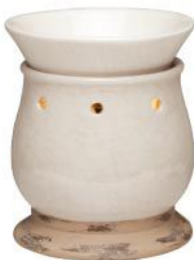
NEW Contenta R C £25