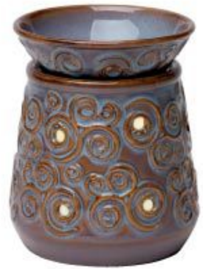
Lisbon R £30