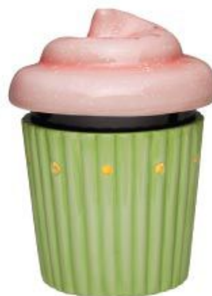
NEW Cupcake £25