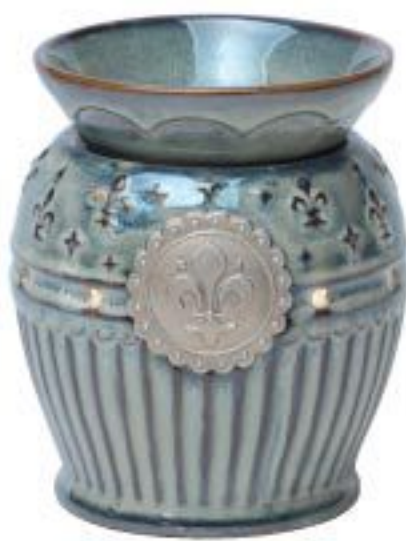
Charlemagne R £30