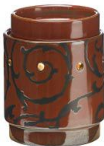
La Paz R £25