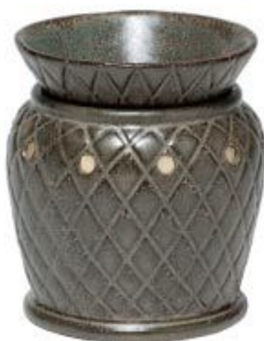
Mission Slate R £25