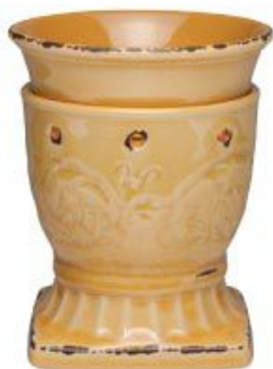
NEW Citron C £30