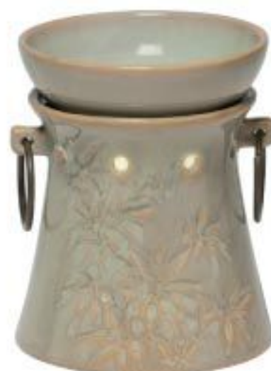
Bamboo Tali R £30