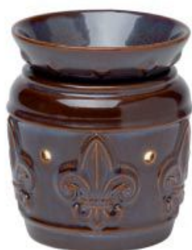
Chateau R £25

A rich chocolate-brown warmer dish is sandwiched between a pleated base and removable dollop of fluffy frosting, sprinkled with powdered sugar accents and vent holes to release delicious fragrance.