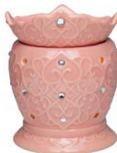
NEW Tiara £25