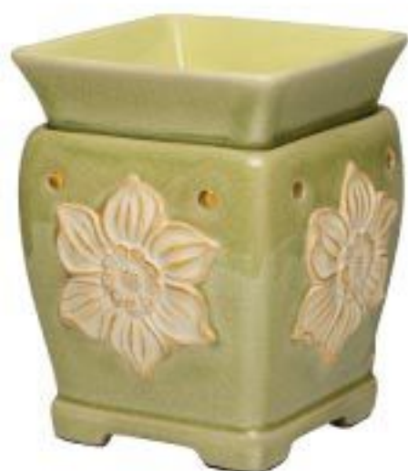
NEW Daphne C £25