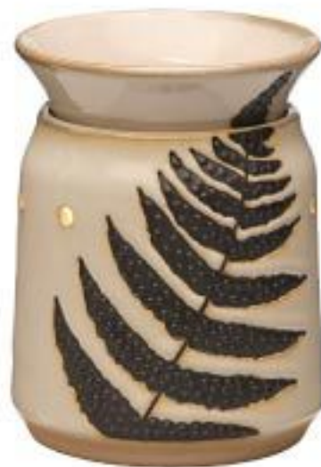
Fossil Fern R £30