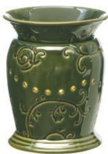
English Ivy £30