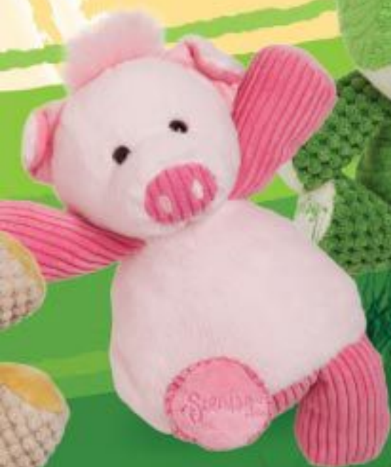
Baby Penny the Pig